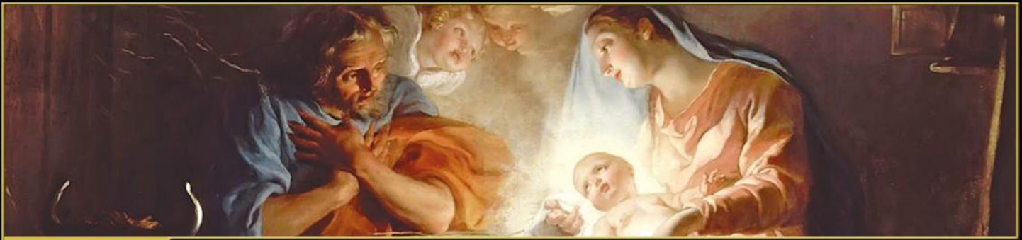
© Diocesan / The Athenaeum - Nativity (1730) - Noel-Nicolas Coypell III